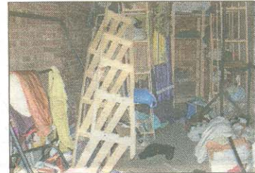
Distraught actors from Garden Suburb Theatre have been left without costumes after the garage theft.

tumes to top productions at the National Theatre and for the Royal Shakespeare Company.